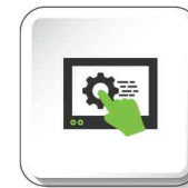
Access & Interface Solutions