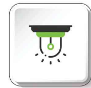
Lighting & Security Integration