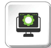
Simplified Operations Platforms