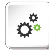
Control & Automation Systems

As early adopters of Native BACnet, Alerton Australia's solutions are built on open, scalable platforms that integrate seamlessly with existing systems, ensuring flexibility and long-term performance. By combining intelligent design with proven technology, we help clients simplify operations, enhance energy efficiency, and stay ahead in an increasingly automated world.